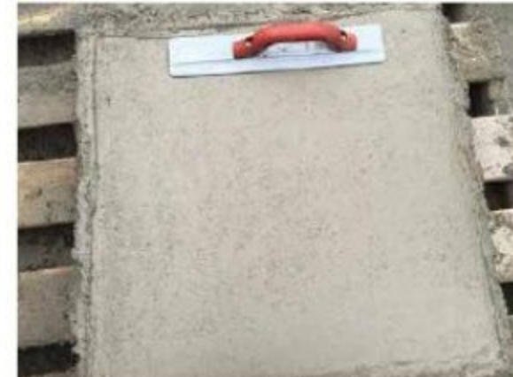
Fig. 11: Natural fiber mixture (WNF) finished with a magnesium trowel

With respect to compressive strength, all three mixtures readily meet the CSA A23.1 minimum design strength of 5100 psi (35 MPa) at 28 days for concrete with a Class C1 exposure. Clearly, natural fiber addition does not have any