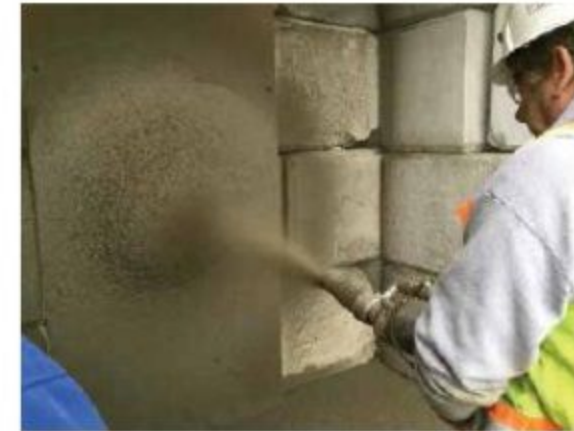
Fig. 5: Shooting a beehive of plain concrete mixture (WP) 6 in. (150 mm) thick on a vertical plywood panel

Note: Specified slump is 3 ± 1 in. (70 ± 20 mm); specified as-shot air content is 3.0 to 6.0%.