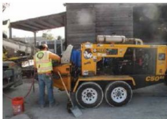
Fig. 13: Reed C50 pump used to pump wet-mix process shotcrete