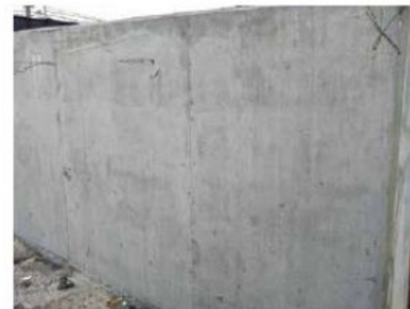
Fig. 18: Stripped face of L-shaped wall is defect-free