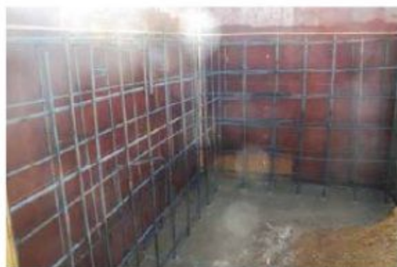
Fig. 14: Formwork and reinforcing bar for L-shaped wall

the natural hemp-based fiber, and used to construct two structural shotcrete walls for aggregate storage bins. The actual shotcrete mixture designs used are proprietary and so are not reproduced in this paper. Both mixtures had the same portland cement content and contained 15% fly ash by mass of cement. The main difference between the two mixtures was Mixture A had a 3/8 in. (10 mm) pea gravel coarse aggregate and the second mixture, Mixture B, had a 0.5 in. (13 mm) crushed granite coarse aggregate.