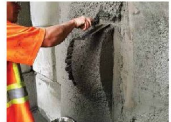
Fig. 8: Cutting and trimming natural fiber mixture (WNF) with no sagging or sloughing

off the plywood panel under its own weight. The synthetic fiber mixture (WSF) displayed better performance in that it did not sag or slough off the plywood form immediately after shooting. However, when it was disturbed and when an attempt was made to cut it with a trowel, it sloughed off the plywood form, as shown in Fig. 6.