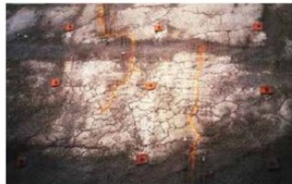
Fig. 1: Plastic shrinkage cracking in shotcrete slope stabilization

Initial laboratory and field trials in Calgary, AB, Canada, indicated that natural hemp-based fiber was very effective in mitigating plastic shrinkage cracking. Consequently, the fiber manufacturer decided to commission a comprehensive study to evaluate the performance of the natural hemp-based fiber in cast-in-place concrete and wet- and dry-mix shotcretes, compared to plain concrete control mixtures