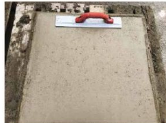
Fig. 10: Synthetic fiber mixture WNF finished with a magnesium trowel

By contrast, the mixture with natural fiber displayed superior finishing characteristics to both the plain shotcrete mixture and the synthetic fiber mixture. The treated natural fiber provided the applied shotcrete with greater cohesion