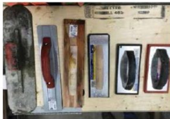
Fig. 9: Finishing tools used, from left to right: steel trowel, magnesium trowel, wood float, hard rubber float, textured rubber float, and sponge float

While in some shotcrete applications, such as ground support in tunnels and mines and rock-slope stabilization, the final surface is left in the rough, natural, as-shot surface condition (such as can be seen in Fig. 7), there are many applications where the applied shotcrete is cut and trimmed to line and grade and then finished to a specified surface tolerance and finish texture. This is common in structural