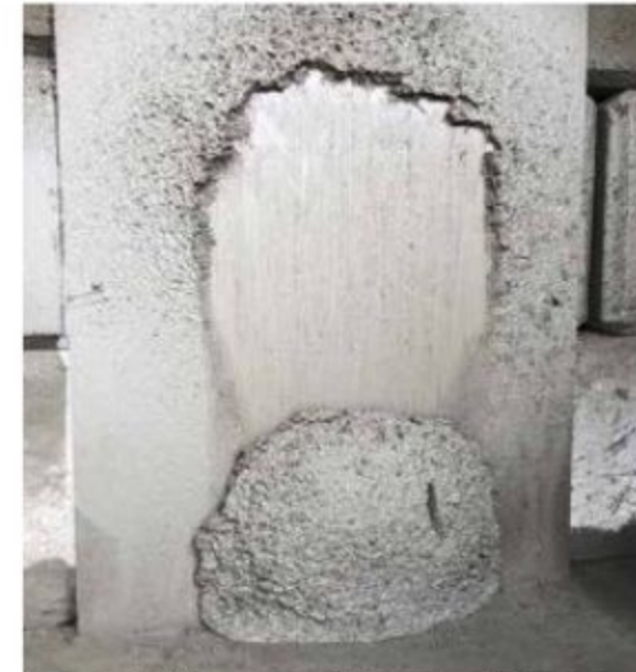
Fig. 6: Synthetic fiber mixture (WSF) sloughed off plywood panel after being disturbed by cutting