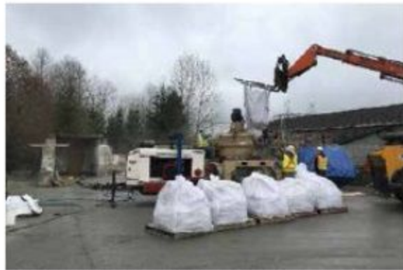
Fig. 2: Prepackaged dry shotcrete materials discharging into pan mixer