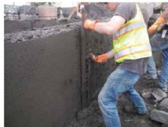
Fig. 16: Trimming shotcrete to shooting wires with cutting screed (rod)

shooting wires. Because of the very cohesive characteristics of the natural fiber-reinforced shotcrete, the finisher using the cutting screed (rod) could follow immediately behind the nozzleman (only a few feet away), cutting and trimming the shotcrete to the shooting wires to control line and grade. Figure 16 shows the finisher trimming the shotcrete to the shooting wires in the straight wall.