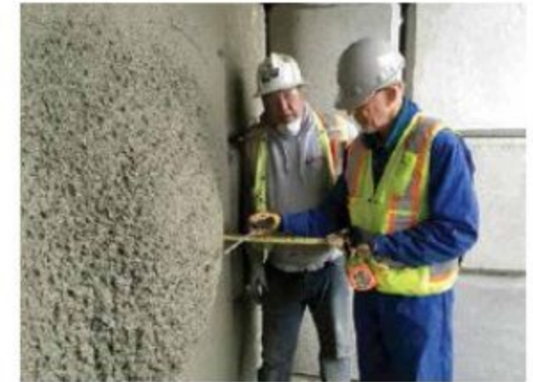
Fig. 7: Measuring thickness of natural fiber mixture (WNF) beehive