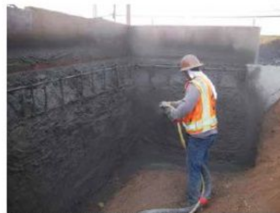
Fig. 15: Bench-gun shooting L-shaped wall

Shooting wires had been installed to control line and grade and the nozzleman shot the final layer to just cover the