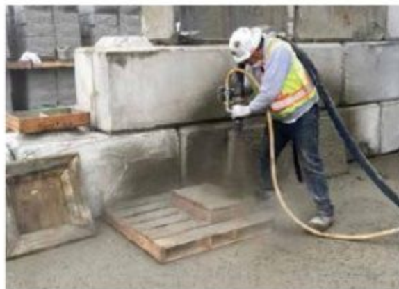
Fig. 4: Shooting into mold for plastic shrinkage cracking testing

the 1.0 yd 3 (0.76 m 3 ) pan mixer. Such mixers are commonly used in the precast concrete industry but are also very useful for laboratory studies. Weighed-out quantities of the loose natural and synthetic fibers were added to mixtures WNF and WSF and mixed for a minimum of 5 minutes. The quantities of water-reducing and air-entraining admixtures added were adjusted as necessary to produce the required slump and air content.