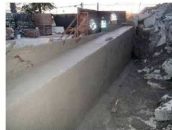
Fig. 17: View of finished straight wall

A finisher with a darby (long wood float) followed right behind the cutting screed operator, closing and smoothing the shotcrete surface. Final finishing with wood hand floats was carried out to provide a stucco-like surface finish appearance. No fibers were found protruding in the finished shotcrete surface. Figure 17 provides a view of the finished face of the straight wall. The nozzleman and finishers were impressed with the enhanced productivity provided by being able to bench shoot the walls to their full height in one pass and, after shooting of the layer, follow immediately behind the nozzleman with finishing operations, without any problems of shotcrete sagging, sloughing, or fallout. The finishers also commented on how easy it was to finish the walls; the natural fiber appeared to act as a finishing aid for the shotcrete.