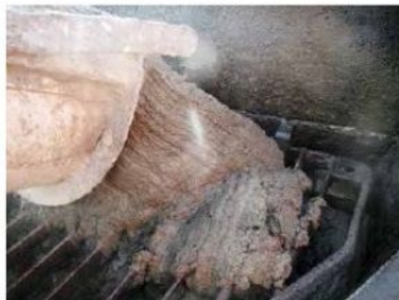
Fig. 12: Natural fiber-reinforced shotcrete (Mixture B) being discharged from concrete truck chute into pump hopper; note highly cohesive nature of mixture

performance in a full-scale field trial, with ready mixed concrete batching, mixing, and supply, in a structural shotcrete application. The evaluation was carried out at the Jos. J. Albanese yard in Santa Clara, CA. Two different wet-mix shotcrete mixture designs commonly used by them in the Bay Area were modified by the addition of