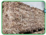
Field Fiber Feedstock